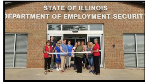
NCI Works / One Stop Center New location 406 Ave C, Sterling 815-625-2313