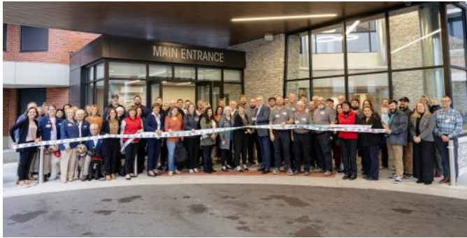
CGH Medical Center Lobby Renovation 100 E LeFevre Rd., Sterling 815-625-0400