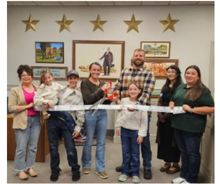
doughMAMA 815-535-7025 hotplate.com/doughmama3