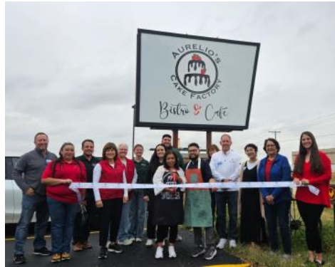
Aurelio's Cake Factory New location - 2907 Locust St., Sterling 815-626-2253