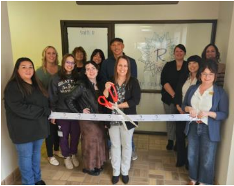
Roberts Counseling, PLLC 1503 1st Ave, Unit B, Rock Falls 563-293-6917