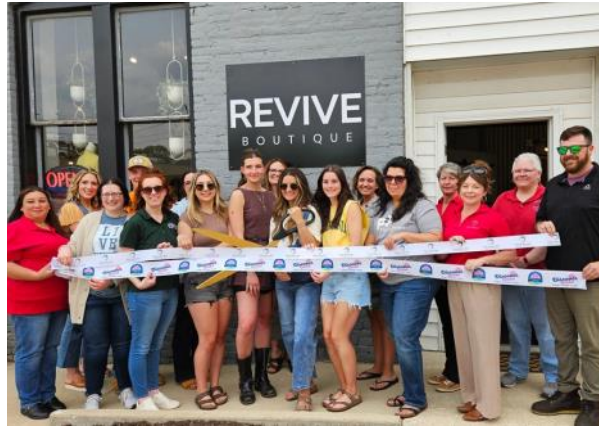
Revive Boutique 116 E. 1st St., Dixon 815-590-1493