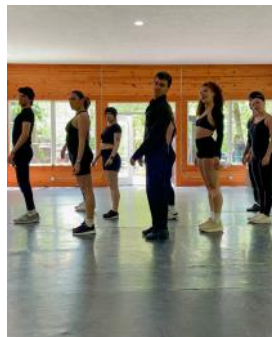
1. Picture of 2025 company of artists