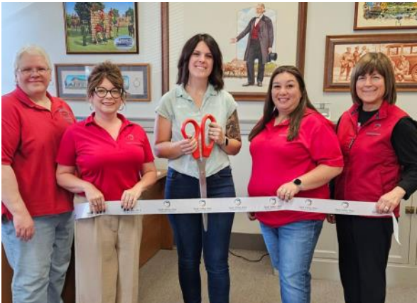
Stateline Solar 310 W. Main St, Lena 815-580-3011