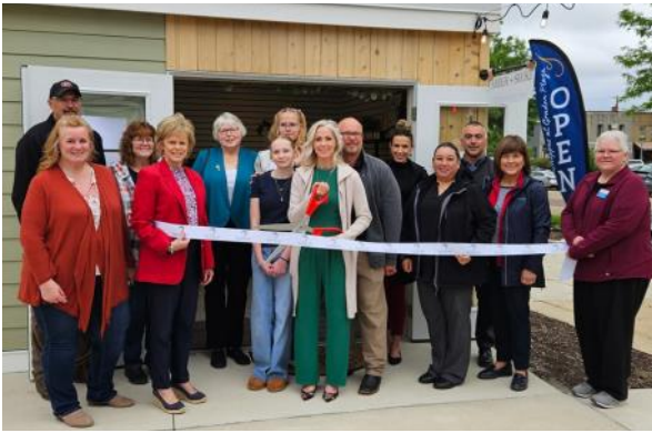
Amber + Smoke 310 2nd St., Unit 1, Sterling amber-smoke.com