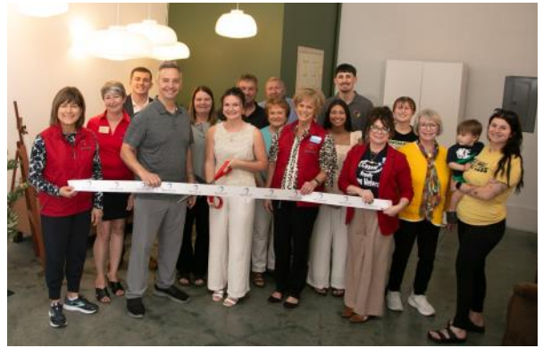
Grot Studio x Meg Frank Photography 1119 Palmyra St., Dixon 815-284-3211