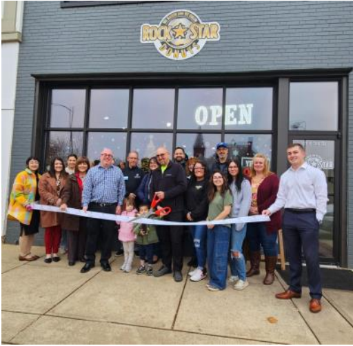
Rock Star Donuts 121 E. 3rd St., Sterling 815-632-3110