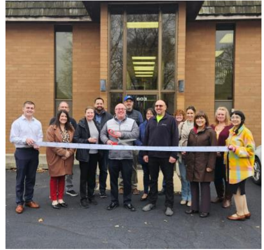
Kurt and Brian Properties 603 1st Ave, Sterling 815-535-7947

We are excited to welcome Sauk Valley Water Ski Shows to the SVACC! Check out their facebook page to stay up-to-date on their 2026 offerings at Swards Park in Rock Falls.