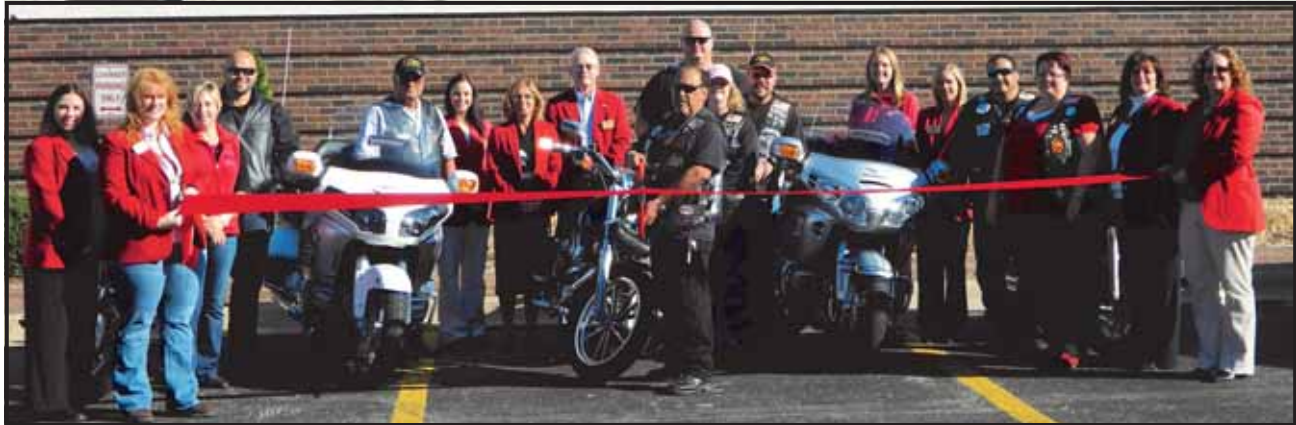
Shield MC, Dixon Chapter 815-440-3486 www.shieldmc.org