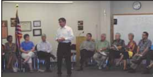
Congressman Schilling responds to a question.

During the event the Congressmen answered questions and offered updates to various pieces of legislation they have either sponsored or co-sponsored during the current legislative session. The event was received so well they indicated they would like to make this a quarterly event with the Chamber. Watch your email and chamber newsletter for details of the next Congressional update.